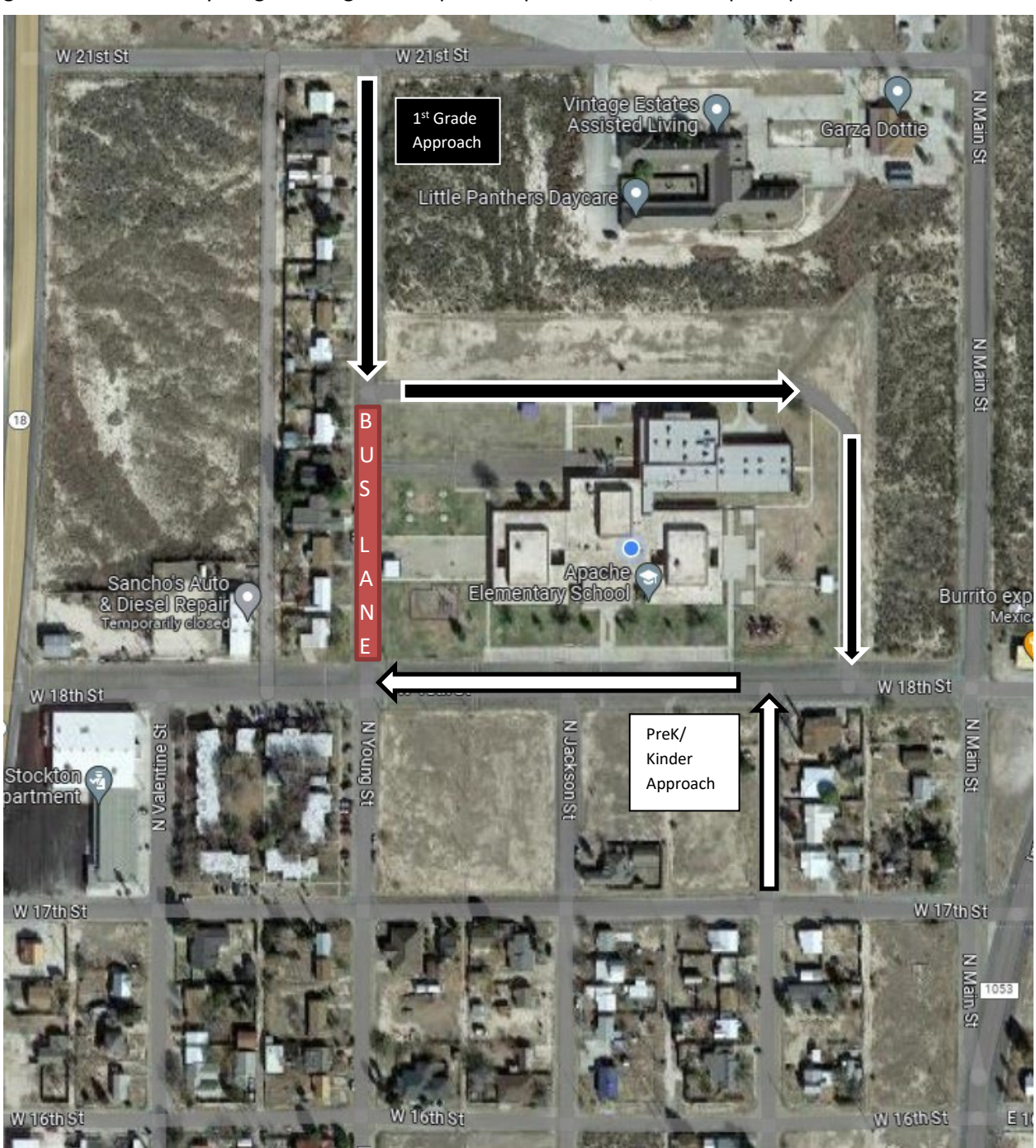
Page | 25

Use the following approaches when coming to Apache Elementary for student pick-up at 3:50pm.\ 1^{st} grade students with younger siblings will be picked-up in the PreK/Kinder pick-up area.